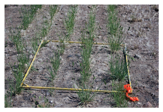
Figure 2. Excellent establishment of crested wheatgrass. The suppression of cheatgrass following wildfires is critical if we are going to restore and rehabilitate burned rangelands.

migrant' forage kochia ( Bassia prostrata ) (0.6 kg/ha [0.50 pound/acre]), Wyoming big sagebrush (0.3 kg/ha [0.25 pound/acre]), and 'Ladak' alfalfa ( Medicago sativa ) (0.3 kg/ha [0.25 pound/acre]).