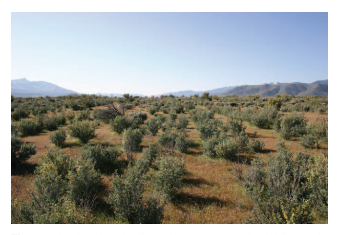
Figure 7. Antelope bitterbrush seeding using a rangeland drill in northeastern California. Notice that the density of the shrubs is so high that they are actually smaller in size, showing that they are having a difficult time competing for limited resources.

Not a single pound of antelope bitterbrush was purchased for these seeding efforts; today that is not the case as this critical browse species is being seeded back onto rangelands.