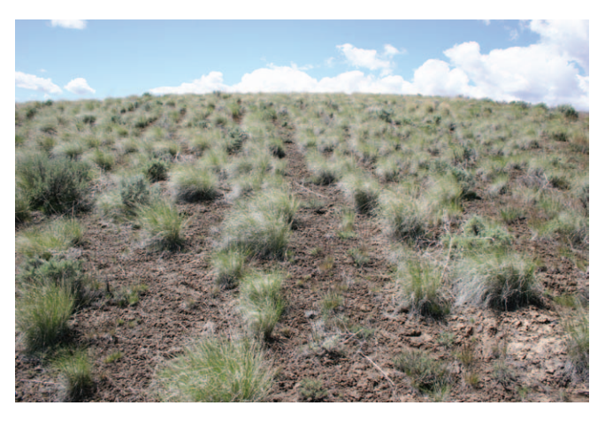
Figure 5. A successful seeding in a formerly Wyoming big sagebrush/ bunchgrass community in northern Nevada. Bluebunch wheatgrass, crested wheatgrass, Wyoming big sagebrush, and 'Immigrant' forage kochia made up the seed mix.

One of our more successful seedings occurred in northern Nevada and consisted of discing and fallowing the site, seeding the site with bluebunch wheatgrass ( Pseudoroegneria spi cata ssp. spicata ) 4.6 kg/ha (4 pounds/acre) and crested wheatgrass 4.6 kg/ha (4 pounds/acre) using a traditional rangeland drill and then broadcasting 'Immigrant' forage kochia 1.1 kg/ ha (1 pound/acre) and Wyoming big sagebrush 0.3 kg/ha