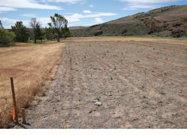
Figure 3. The use of Landmark XP in northern Nevada. Notice the level of cheatgrass control as we prepare to seed the site.

Discing the seedbed to bury cheatgrass seeds deeper in the seed bank can also be a helpful tool at decreasing cheatgrass seed bank densities. The objective of this method is to disc