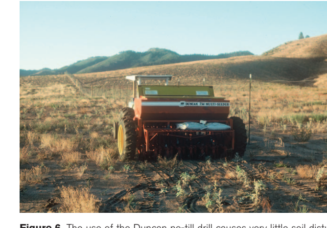
Figure 6. The use of the Duncan no-till drill causes very little soil disturbance and has excellent seed placement attributes. Obviously, rougher terrain would limit this type of equipment.

For the purpose of this paper we will discuss the results from mechanical seeding efforts. We seeded, cleaned, and uncleaned antelope bitterbrush at 2.3 kg/ha (2 pounds/acre) and 3.4 kg/ha (3 pounds/acre) rates using a traditional rangeland drill and a Duncan no-till drill (Fig. 6) at various sites in northwestern Nevada and northeastern California. The