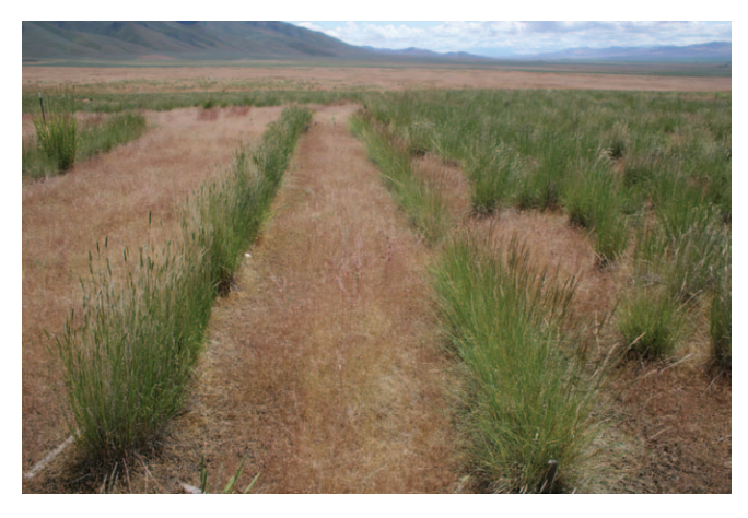
Figure 4. Of the 16 species tested at this site in northern Nevada, only two species (Sherman big bluegrass and crested wheatgrass) successfully established.

g/ha (1.75 ounce/acre) rates. In our herbicide plots we have experienced a decrease in both the cheatgrass seed bank, 75%, and cheatgrass above-ground densities, 89%. Again, this decrease in cheatgrass seed bank and above-ground densities assists the seeded species in having the ability to establish in the face of less cheatgrass competition.